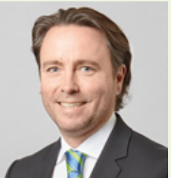
Thomas Eisen Solutions